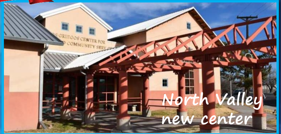
North Valley new center