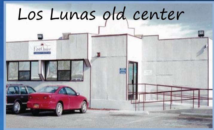
Los Lunas old center