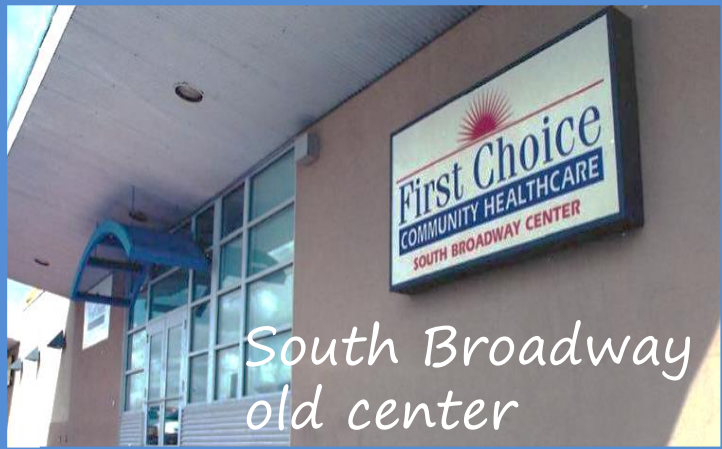
South Broadway old center