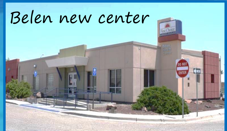
Belen new center