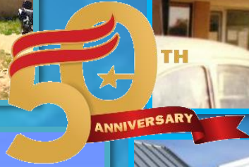
Edgewood new center