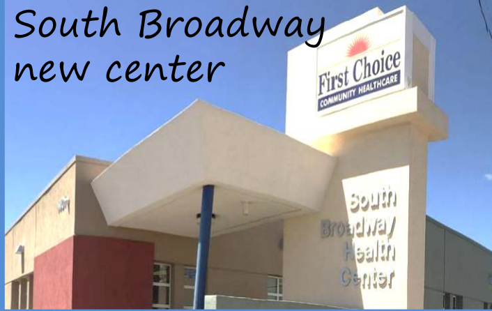
South Broadway new center