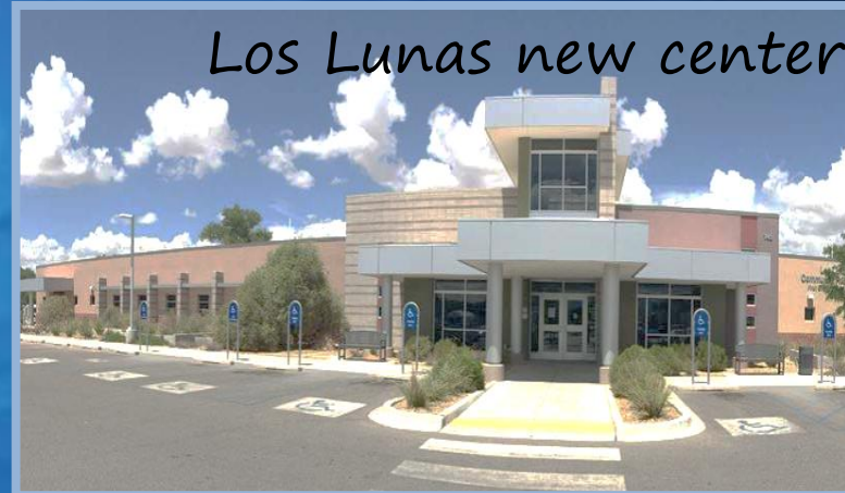
Los Lunas new center