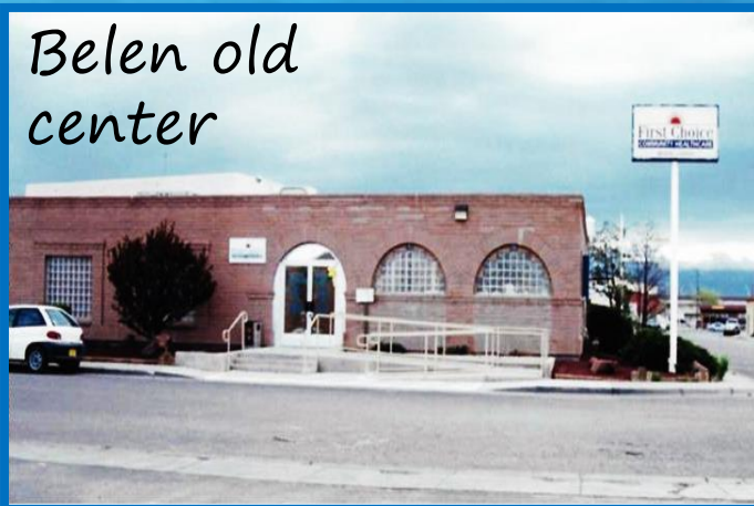
Belen old center