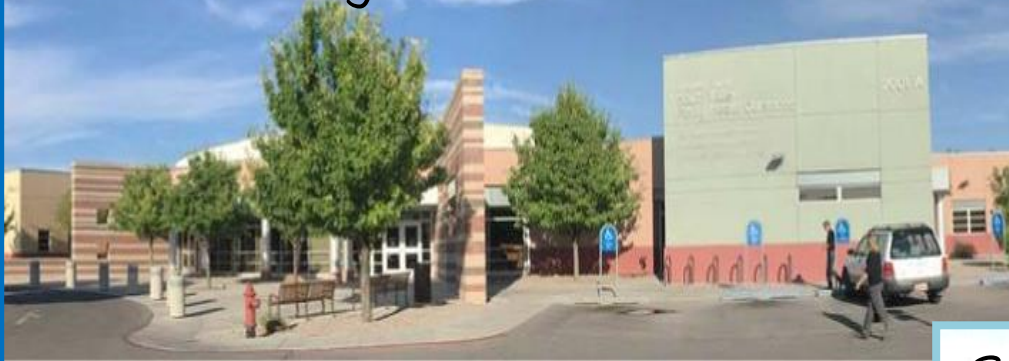
South Valley new center