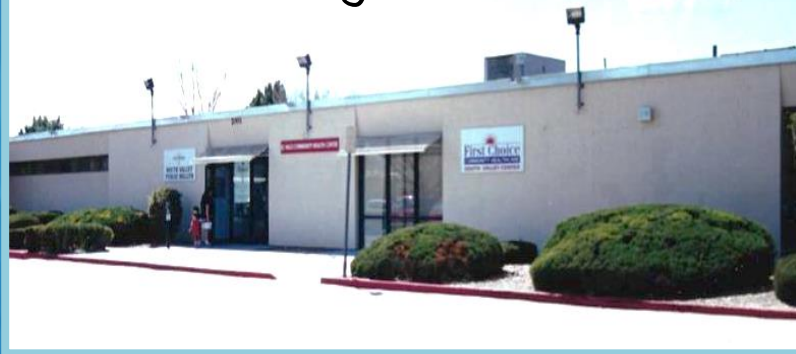
South Valley old center